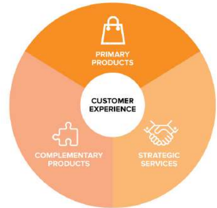
NetSuite Whole Offering

The same is true for your business solution partners. It takes a team of dedicated professionals tightly focused on your business sector to deliver a truly competitive platform. That's why NetSuite created the Wholesale Distribution team. We have combined sales, marketing, solutions consultants, software development and professional services into one team. This Wholesale Distribution team is dedicated to innovating, building, selling and delivering the best solution experience on the market.